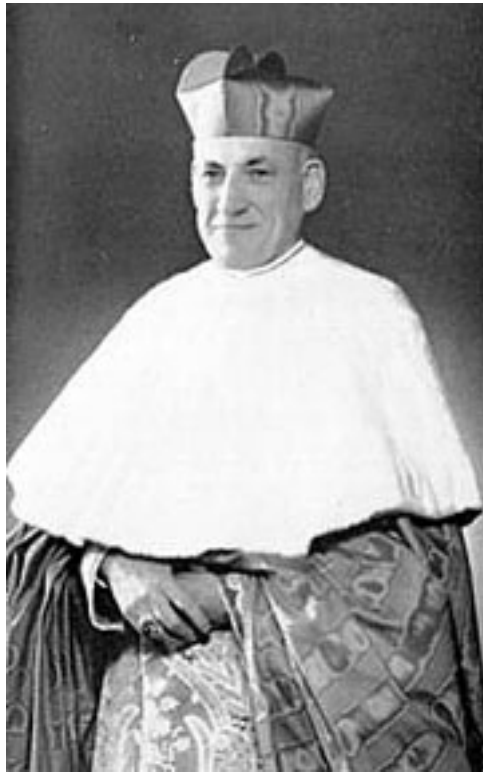
Archbishop Richard James Cardinal Cushing (1944-1970)